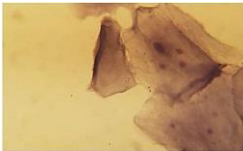
Fig. 1. Photomicrograph of a cell with 3 micronuclei (arrows) in buccal mucosa smear of waterpipe smoker ( \times 1000 , Feulgen staining)