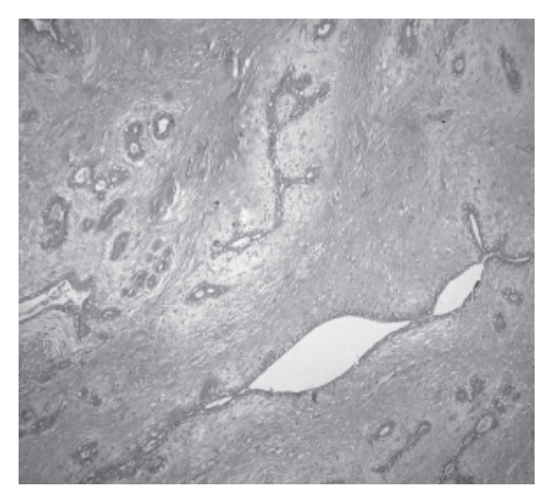
Figure 1. Slit-like glandular spaces in fibromyxoid stroma.(H&E X100)

Gross investigation showed a solid grayish cream mass 2.2 cm in diameter which was clearly bordered and showed a regular appearance on sectioning. Microscopic evaluation revealed epithelial and stromal proliferation in the fibromyxoid stroma. The epithelial structures composed of slit-like spaces (Figure 1) which were lined with bilayers of secretory epithelial as well as myoepithelial cells (Figure 2). No evidence of epithelial hyperplasia was observed. In some parts, papilla-like nodules were noticed, but none were real papillae and lacked a leaf-like appearance. The fibromyxoid stroma consisted of spindle cells with elongated nuclei, small nucleoli, and little cytoplasm. Its cellularity was rather low and no atypia or mitosis was seen. IHC study shows positive reactivity for GCDFF 15 in epithelial cells.