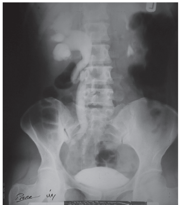
Fig. 1: The right kidney shows hydronephrosis and the ureteral obstruction is visible above the bladder

of right flank pain. The physical and gynaecologic examination and all laboratory workups were normal except for microscopic hematuria reported in previous urine analysis. Ultrasonography showed right kidney hydronephrosis. CT scan and IVU revealed stenosis of distal portion of right ureter. The patient planned for surgery; after opening by Gibson incision and resection of stenosis, anastomosis performed by Psoas Hitch method. The histologic examination of the submitted specimen confirmed ureteral endometriosis characterized by endometrial glands and stroma located in outer half of ureter wall which extends to submucosa (Fig. 2). The patient discharged in good health condition and ureter stent removed after 4 weeks.