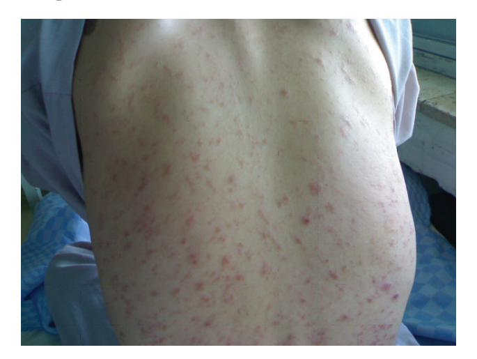
Fig.1: Maculopapular erythroviolaceous rash affecting, trunk, upper and lower extremities

days before the appearance of the symptoms. The skin rash did not look like a purpuric eruption associated with the thrombocytopenia so a consultation was made to a dermatologist. According to the consultation, the rash was thought to be Brucellar dermatitis. The skin biopsy showed a perivascular lymphohistiocytic reaction (Fig. 2,3). Doxycycline (200 mg/day) and rifampin (600 mg/day) were started. The rash began to disappear within two days and pancytopenia began to resolve within three days of therapy. The patient was discharged from the hospital 7 days later in good health. At the 3-week follow-up, the patient came to control and had made a full clinical recovery; the skin rash was completely resolved and the platelet count had increased from 60x109/L to 150x109/L, Hg from 10 to 12 g/dl and leukocyte count from 2x109to 3/5x109/l. Antibiotic therapy has been planned to continue until completion of 6 weeks of treatment