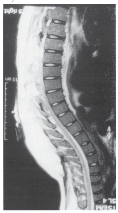
Figure 1: MRI (sagittal view) showing paravertebral soft tissue mass involving T4-T9

medication she was taking was Desferal. On physical examination, upper limb forces were 5/5 and lower limb forces were 2/5 and 3/5 in proximal and distal parts respectively. Hypoesthesia was also present in both lower limbs. Babinski reflex was also flexor at both sides. Other organs were normal on physical exam. Hemoglobin was 9.4 g/ dl (normal range:12-14 g/dl) on admission. MRI of thoracic spine without Gadolinium injection (sagittal T1, T2, axial T2) revealed soft tissue masses on both sides of the thoracic spinal area at T4-T9 level (Figure 1). All discs were normal in signal intensity without herniation. Bony spinal canal was normal in alignment and size without abnormal signals. Extramedullary hematopoiesis radiologically suggested according to patient's history. She underwent laminectomy and intraoperative pathology consultation was done which showed heterogeneous population of hematopoietic precursor cells including erythroid, myeloid, and megakaryocytic series (Figure 2). She was discharged in good condition two weeks after operation with Desferal mesylate 1000 mg twice weekly.