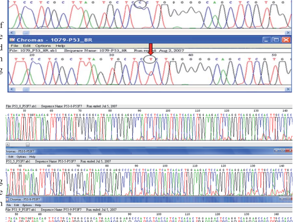
Fig. 2: Partial sequence of the p53 gene from a sample (upper) without mutation and a sample with mutation in codon 302 (lower) indicating homozygote C>T conversion