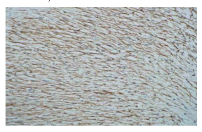
Fig. 3: The proliferating fibroblast like cells of inflammatory fibroid polyp showing reactivity to CD34 (avidin biotin peroxidase ×400)

Fig. 2: Photomicrograph showing proliferating fibroblasts like cells arranged around thick walled vessels. The cells are uniform, have abundant cytoplasm with bland spindle shaped nuclei. Background reveals scattered inflammatory cells predominantly of eosinophils (hematoxylin & eosin \times 400)