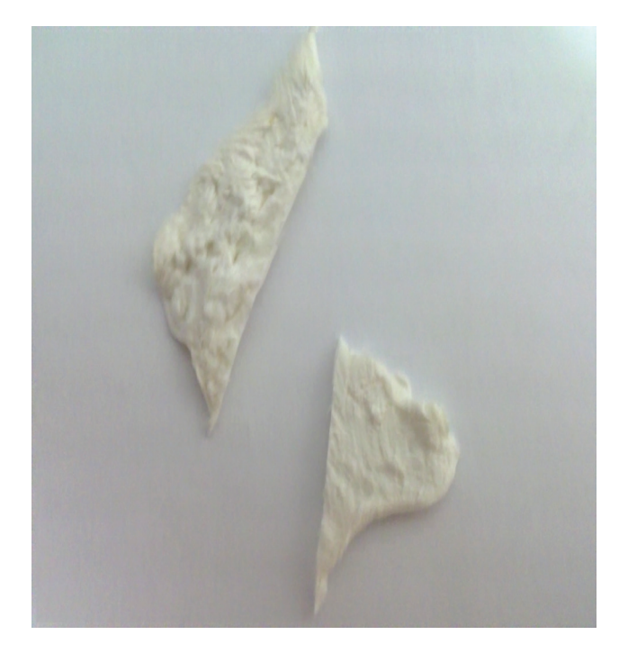
Fig. 1: Lyophilized sheep's ECM sheet after processing

Lyophilized extracted matrix after processing, is visible in Fig. 1, which is a white material width 0.12\pm0.01 mm. The ultrastructure of extracted matrix was evaluated with SEM. The particles were irregularly shaped and could be defined generally as fiber-like (Fig. 2). Examination of the specimens at higher magnification showed that collagen fibers are associated with small particles on the order of 1 µm in diameter.