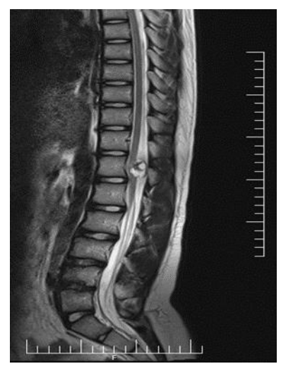
Fig. 1. MRI of spinal cord

The magnetic resonance imaging (MRI) results revealed an intradural extra medullary lobulated cystic lesion measuring 21 \times 21 mm at T12 level. Conus was pushed anteriorly. Mild canal dilation was seen and discs were intact (Figure 1).