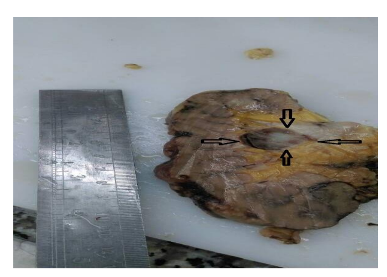
Figure 2. Gross specimen shows a well-defined brownish mass near the hilum (arrow).