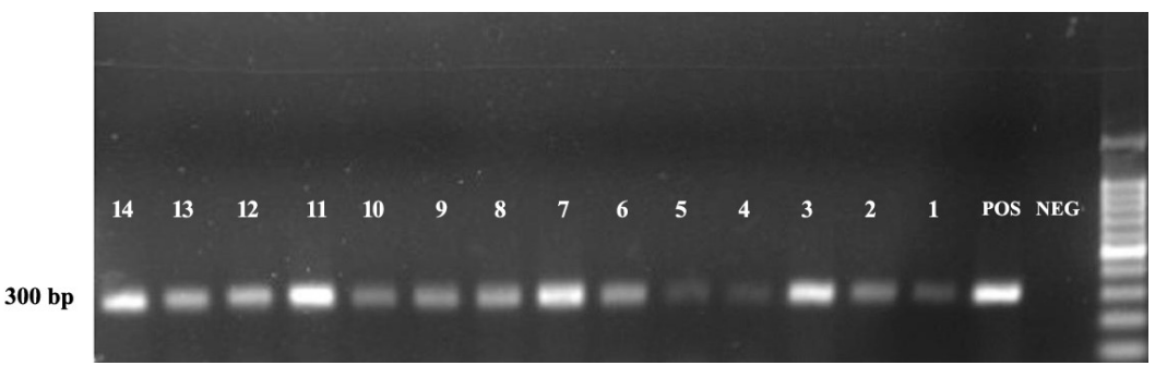
Figure 1. Gel Electrophoresis of the PCR Products of 16S-23S mRNA Genes

The inhibition zone of 22 mm was significantly larger than that of CLSI guidelines (16 mm) as shown in (Figure 2).