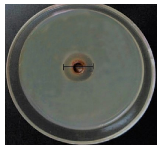
Figure 2. Growth Inhibition Zone by Lactocare