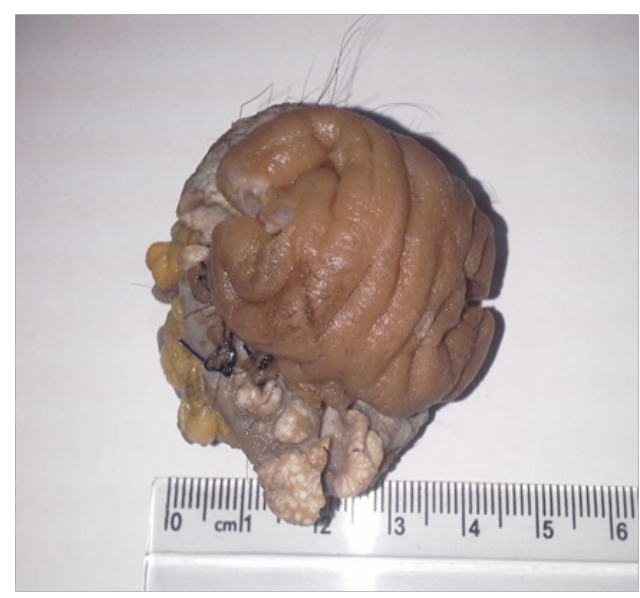
Figure 1. Cutaneous verrucous carcinoma of ileostomy site in gross pathologic examination shows polypoid lesion with verruca-like surface

Microscopic assessment of the Hematoxylin and Eosin (H&E) stained slides confirmed the diagnosis of VC for the skin lesions which resected completely with free surgical margins (Figure 2). Follow up of the patient for six months did not show any evidence of recurrence.