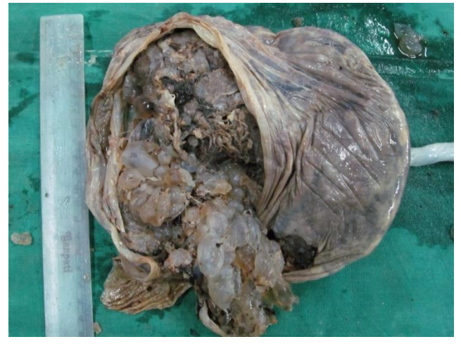
Figure 1. Gross image of enlarged placenta with multiple grape-like vesicles at maternal surface

On histopathology, the sections revealed edematous stem villi with cisterns formation (Figure 2). The blood vessels were dilated and the walls were thickened with the presence of fibromuscular hyperplasia (Figure 3A). Trophoblastic proliferation was absent and terminal villi were normal (Figure 3B). The histology of umbilical cord was normal. PMD was diagnosed on histopathology. Karyotyping of the baby was 46XX without any other abnormalities.