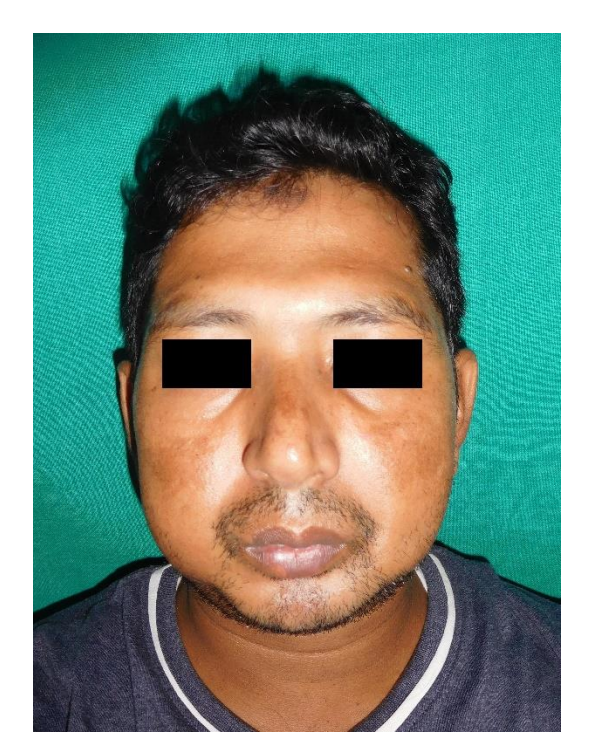
Figure 1. Clinical photograph showing decreased vertical height of lower one third of face.

A 38-year-old male referred with the complaint of partial edentulousness in the lower jaw and intended to get it replaced. The patient gave history of mobility of lower teeth, which gradually became exfoliated in the span of the last 10 years. He had previously consulted multiple dental surgeons for the same issue, where the remaining mobile teeth were extracted. The patient noticed that his lower jaw was becoming thinner progressively after extraction. There was negative history of pain, blood or purulent discharge from the associated region. Medical, family, and personal history were found to be inconspicuous.