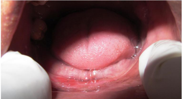
Figure 2 . Intraoral photograph showing completely resorbed mandibular arch and periodontally compromised teeth in maxillary arch.

The patient was subjected to radiological, laboratory, and histopathological investigations. Orthopantomograph showed resorption of the mandibular arch with decreased vertical height of the mandibular body leaving a thin rim and discontinuation in the right lower border of mandible suggestive of pathological fracture (Figure 3). Axial section of computed tomographic image revealed almost completely resorbed lower arch along with hypodense areas in right upper maxilla (Figure 4). Coronal and sagittal sections of the cone beam computerized tomographic (3D-CBCT) image showed hypodense areas in right posterior maxillary region and thin rim of alveolar ridge, observed throughout the length of the mandible. There was loss of integrity of right lower border of mandible, indicating pathological fracture (Fig 5 and Fig 6). Laboratory investigations revealed normal blood picture except for elevated acid phosphatase and decreased alkaline phosphatase levels. Incisonal biopsy was performed from the left mandibular region