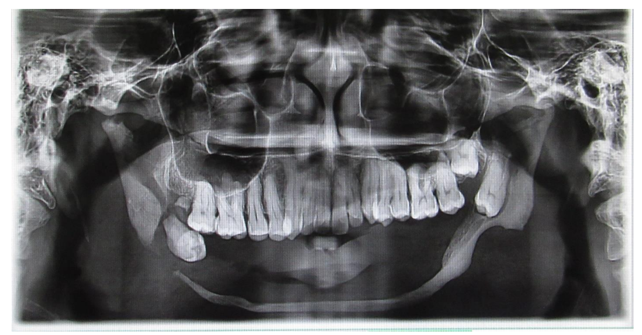
Figure 3. Orthopantomograph showing resorption of the mandibular arch and pathological fracture in the right lower border of mandible.

The patient was explicated about the rapidly progressive nature of the disease and recieved counselling and support as there is currently no definitive treatment.