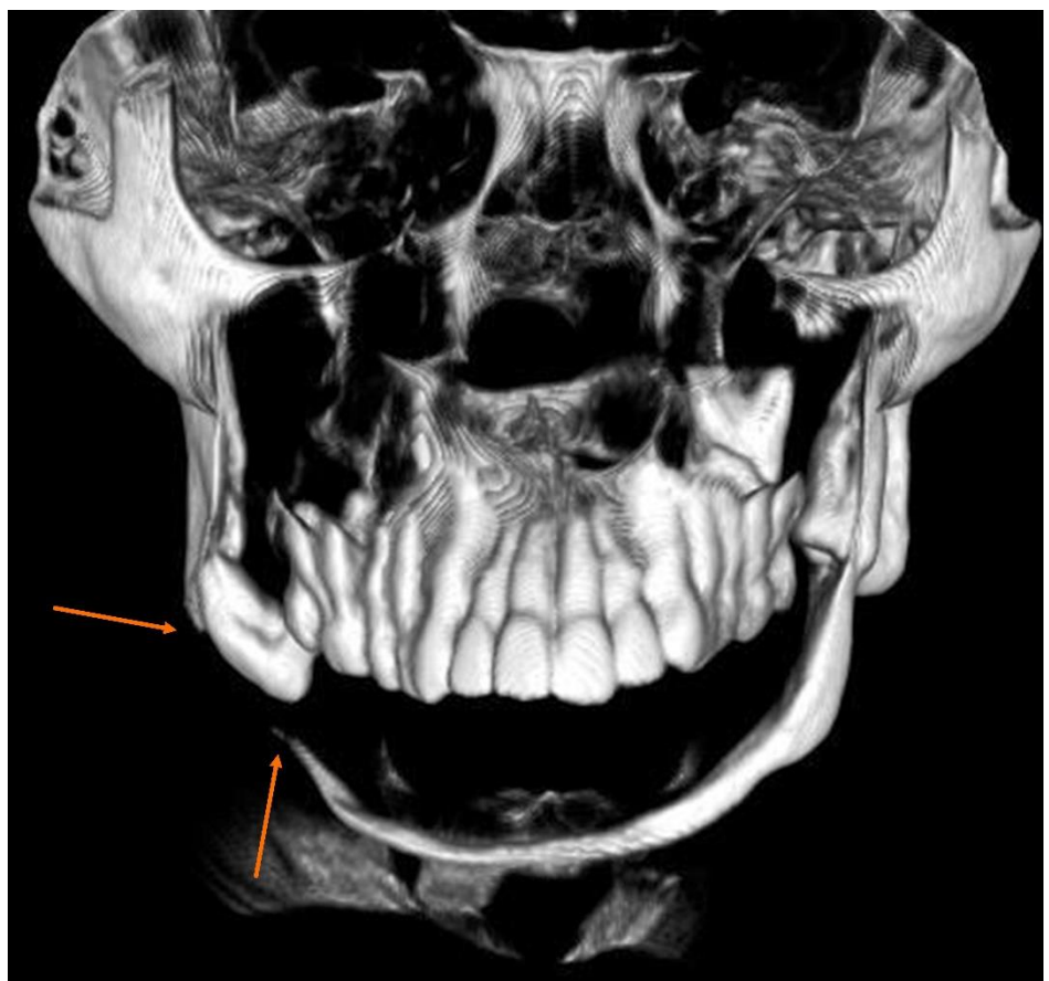
Figure 5. Coronal 3D-CBCT image showing resorbed mandible and pathological fracture of right lower border of mandible (orange arrows).