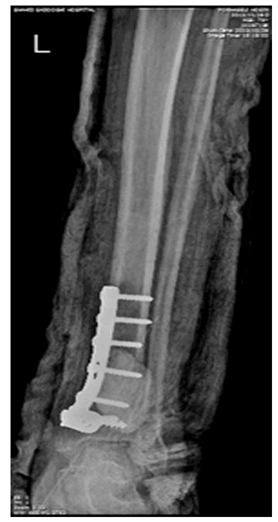
Fig. 4. Curettage and bone fixation