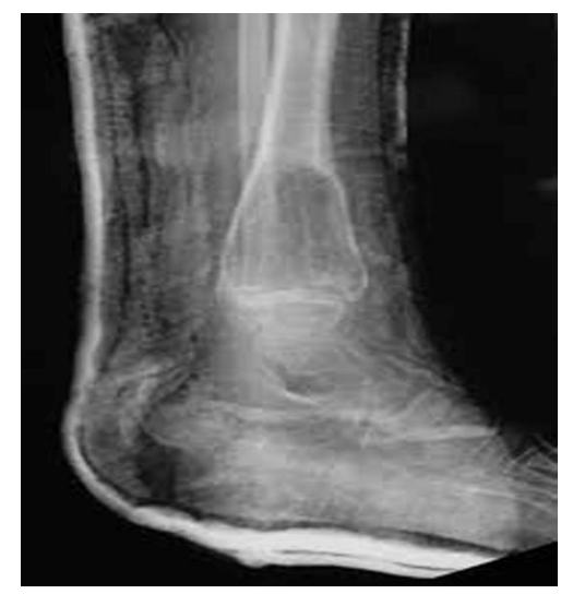
Fig. 1. A bone lytic lesion with undefined margins in the middle part of tibia

In bone marrow biopsy and peripheral blood smears, no evidence of malignancy was found. CT of the abdomen and pelvis was normal. In CT of lung, small opacities were observed in the anterior of right lung upper lobe. Radiography, histopathology, and immunohistochemistry findings confirmed the diagnosis of an intraosseous angiosarcoma. The patient underwent curettage and bone fixation (Fig. 4). After a two-month follow-up, the patient died of pulmonary metastasis.