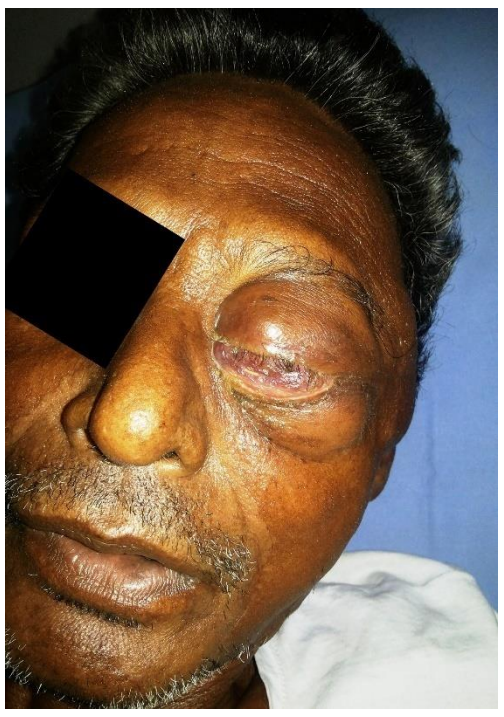
Fig. 2: Gross image of the left eye of the patient showing enlarged eyeball with conjunctival chemosis