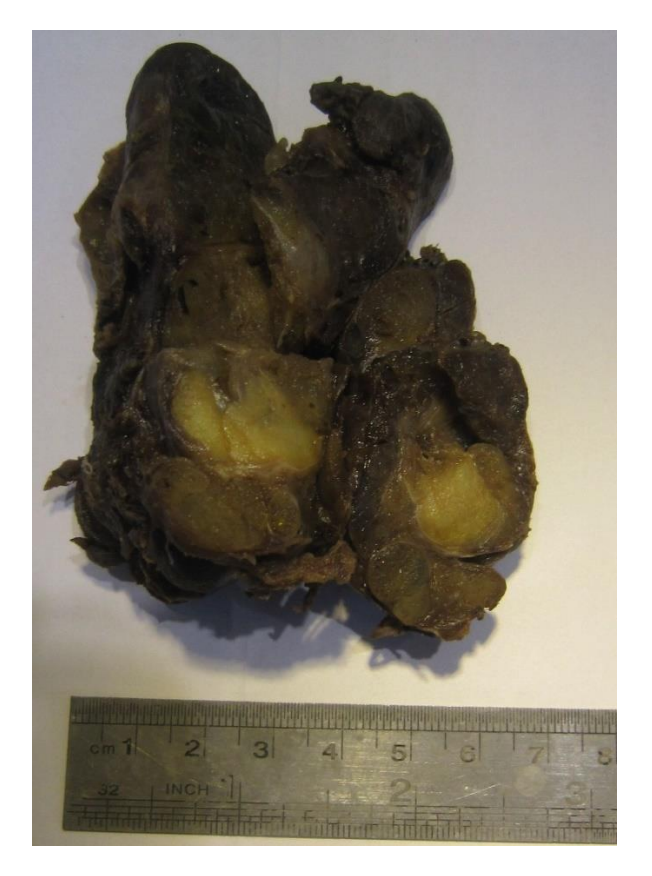
Fig. 1. Gross resected specimen shows an enlarged thyroid gland with a yellowish nodule on the cut surfaces

The surrounding thyroid tissue showed multinodular goiter. No vascular or capsular invasion was identified. No lymphocytic infiltration, follicular destruction, or amyloid deposition was noted. No focus of papillary carcinoma was detected. A diagnosis of adenolipoma of the thyroid gland (thyrolipoma or thyroid hamartoma) in association with multinodular goiter was rendered