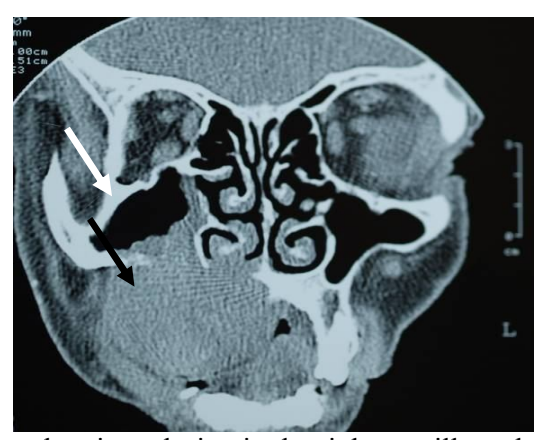
Fig. 3- CT Scan showing a lesion in the right maxilla and sinus maxillary