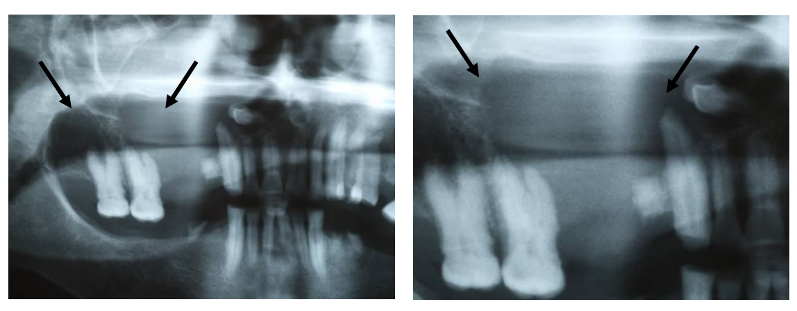
Fig. 2- Panoramic radiograph showing a radiolucent lesion in the right maxilla

B: The nasolabial fold was disappeared at the right of patient face