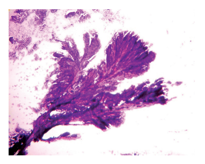
Fig. 1: Smear showing papillary fragment in choroid plexus papilloma (H&E, ×40).

On overall analysis, it was also noted in our squash smears that the cellular details and architectural details of many tumor types were well maintained. For example, certain features like papillae (in choroid plexus papilloma; Fig. 1) and whorls (in meningiomas; Fig. 2a & 2b) were well made out in our squash smears. Besides we noted that in schwannomas, the characteristic alternating hyper and hypocellular areas were well appreciated in squash smears similar to histopathological sections.