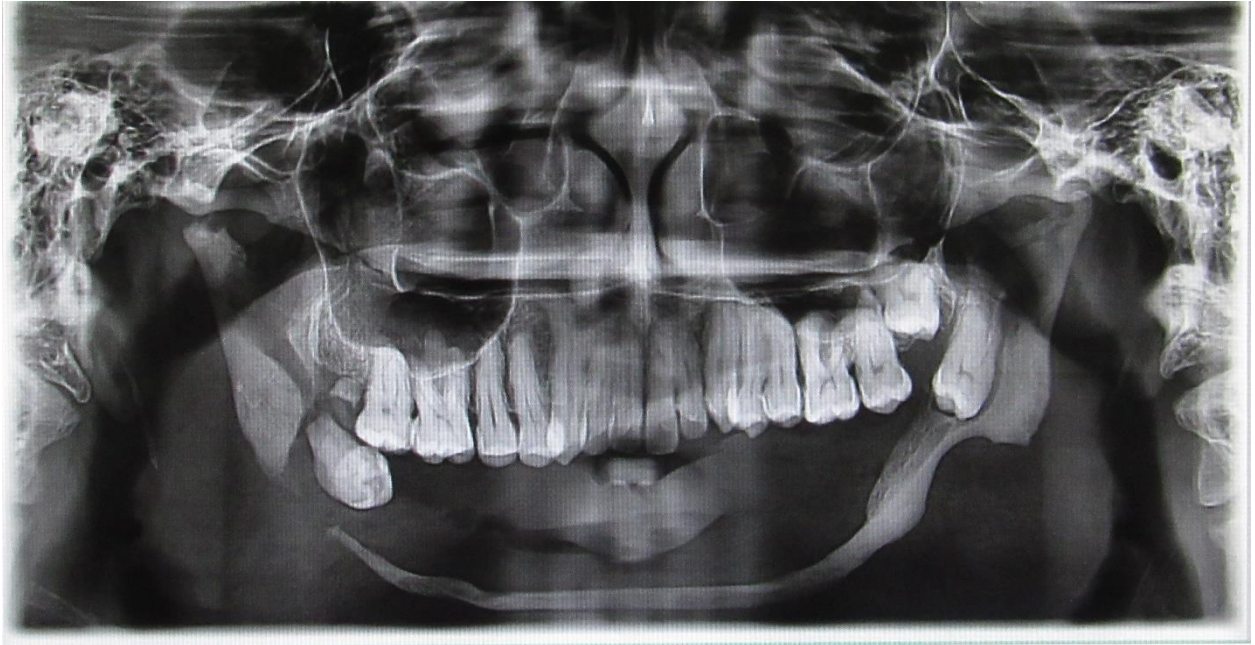
Figure 3. Orthopantomograph showing resorption of the mandibular arch and pathological fracture in the right lower border of mandible.

The patient was explicated about the rapidly progressive nature of the disease and received counselling and support as there is currently no definitive treatment.