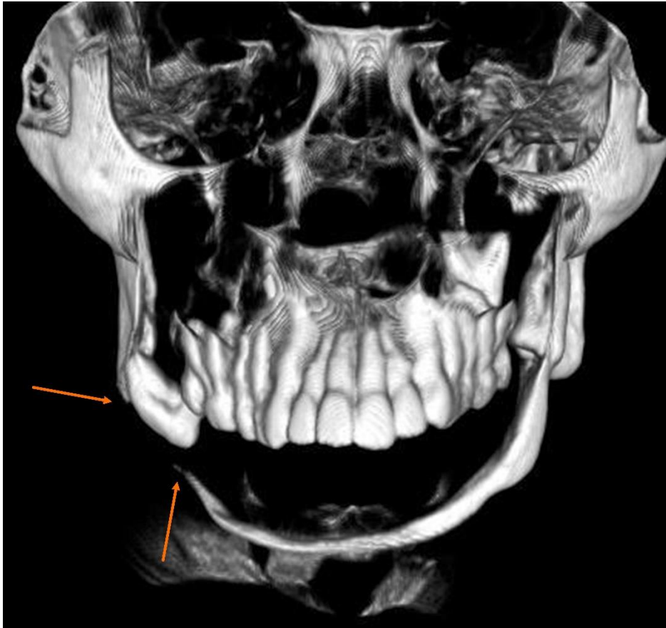
Figure 5. Coronal 3D-CBCT image showing resorbed mandible and pathological fracture of right lower border of mandible (orange arrows).