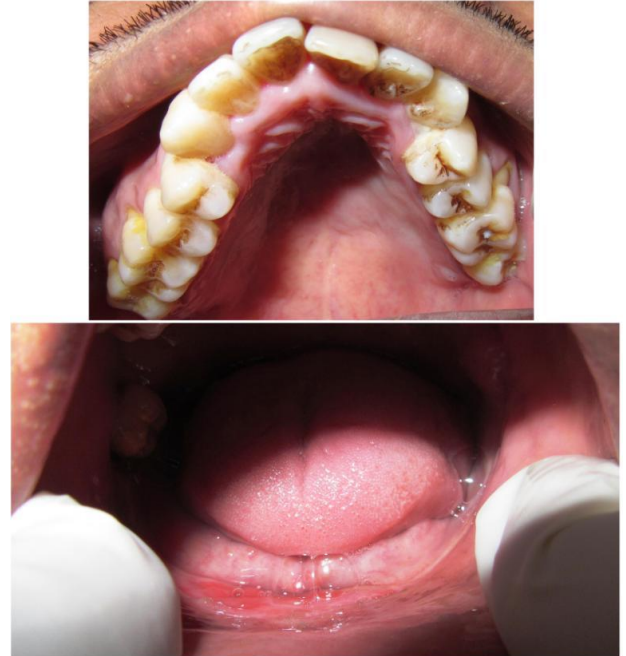
Figure 2. Intraoral photograph showing completely resorbed mandibular arch and periodontally compromised teeth in maxillary arch.

completely resorbed mandibular arch. All the teeth were present in maxillary arch and were periodontally weak (Figure 2). Based on history and clinical features, a provisional diagnosis of osteolytic lesion of mandible was considered.