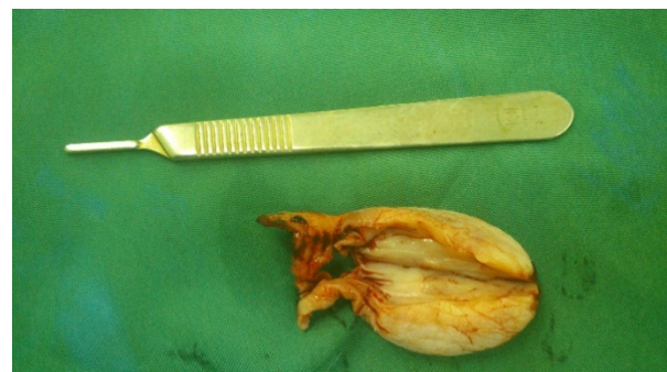
Fig. 3. Excised vaginal polyp