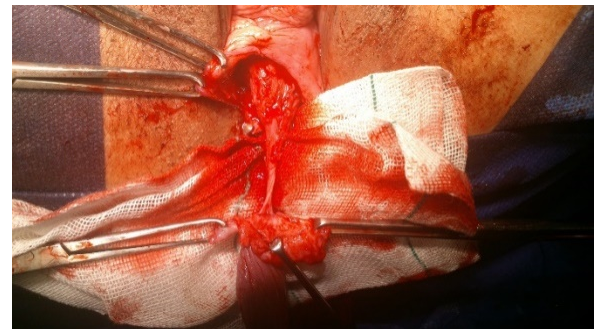
Fig 2. Excision of the polyp