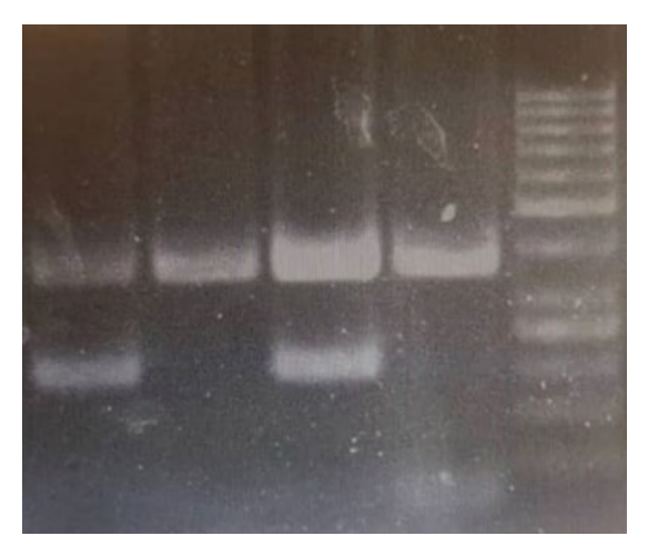
Figure. 1. Electrophoresis of JAK2 PCR products. Positive JAK2 V617F mutations in lanes 1 and 3 with a PCR product of 203 bp.

mutation ( 53.47\pm0.96\% ), and triple-negative cases ( 58.80\pm13.02 ). The lymphocyte percent was also reciprocally lower in JAK2 V617F mutation ( 19.01\pm8.61\% ) in comparison with CALR type 2 mutation ( 37.36\pm1.80 ), and triple-negative cases ( 31.28\pm10.95 ).