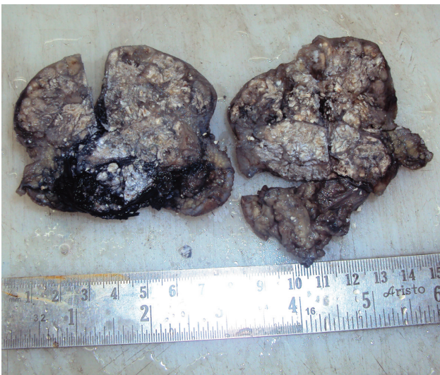
Fig. 1: Gross photograph showing an ill-defined raised nodular mass with grey white cut surface

Grossly wide excision specimen was received in formalin comprising of skin with subcutaneous tissue. Surface of skin showed a raised nodular growth measuring 6.5×5×4 cm. Serial section of the growth were yellowish white with areas of calcification. The neoplasm was seen 0.2 cm away from the base of resection and well away from other skin and soft tissue margins (Fig. 1).