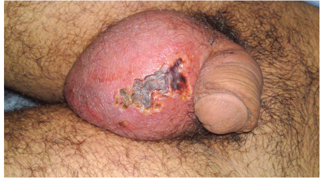
Fig.1: Scrotal ulcer at first presentation

bone marrow aspiration revealed normocellular marrow. A few days later after two doses of G-CSF injection, WBCs increased to 4600/ \mu lit and then one day chemotherapy was prescribed. In spite of appropriate supportive care, patient developed severe pancytopenia and expired one week later.