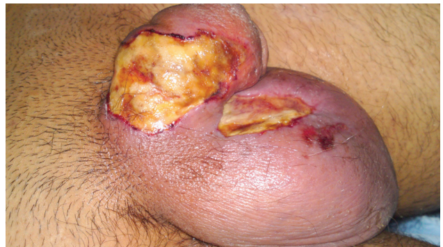
Fig. 2: Extension of scrotal ulcer to penile skin.