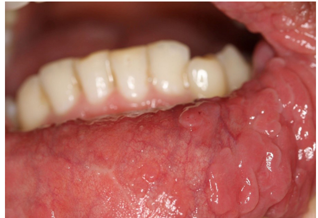
Fig. 2 Multiple, soft, sessile, smooth surface papules and nodules involving upper, and lower labial mucosa, that are so close together that form a cobblestone appearance