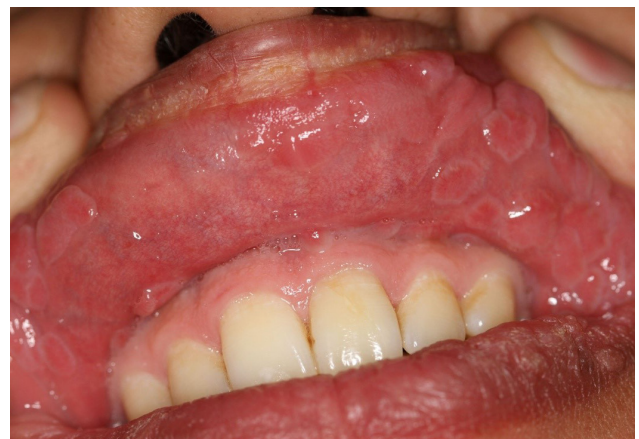
Fig. 4 Individual lesions are discrete and the largest, were interfering with patient's speech and esthetic