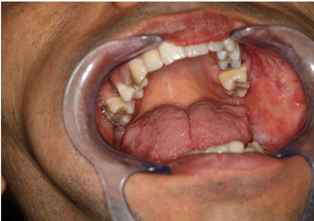
Fig. 1 Focal epithelial hyperplasia. Multiple flat-topped nodules on the buccal mucosa

A 35-year old Iranian man was referred to Department of Oral Medicine, Faculty of Dental Sciences, University of Shahid Beheshti, Tehran, Iran. His chief complaint was multiple oral mucosal lesions in his mouth (Fig.1). The patient was healthy person and his physical examination showed no significant abnormality. Intraoral examination revealed multiple, soft, sessile, smooth surface papules and nodules involving upper, and lower labial mucosa and right and left