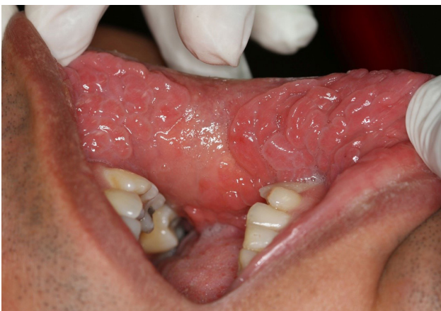
Fig. 3 Multiple flat-topped papules and nodules of normal coloration seen on the lower and upper lip which are clustered so closely and form a fissured appearance