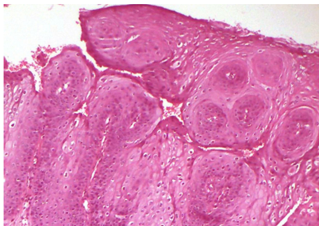
Fig. 6 The hallmark of focal epithelial hyperplasia is an abrupt and sometimes considerable acanthosis of the oral epithelium. The lesional rete ridges are at the same depth as the normal rete ridges, and widened and sometimes club shaped ( \times 20 magnification)