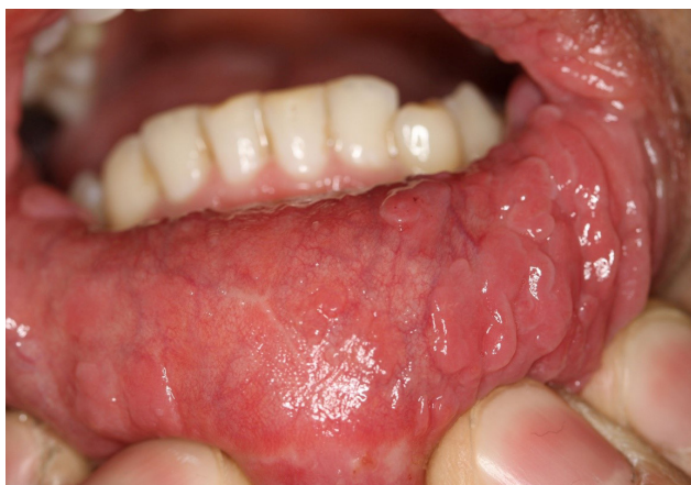
Fig. 5 The largest lesions, which were located at lower and upper lip, were interfering with patient's speech and esthetic. They are clustered so closely